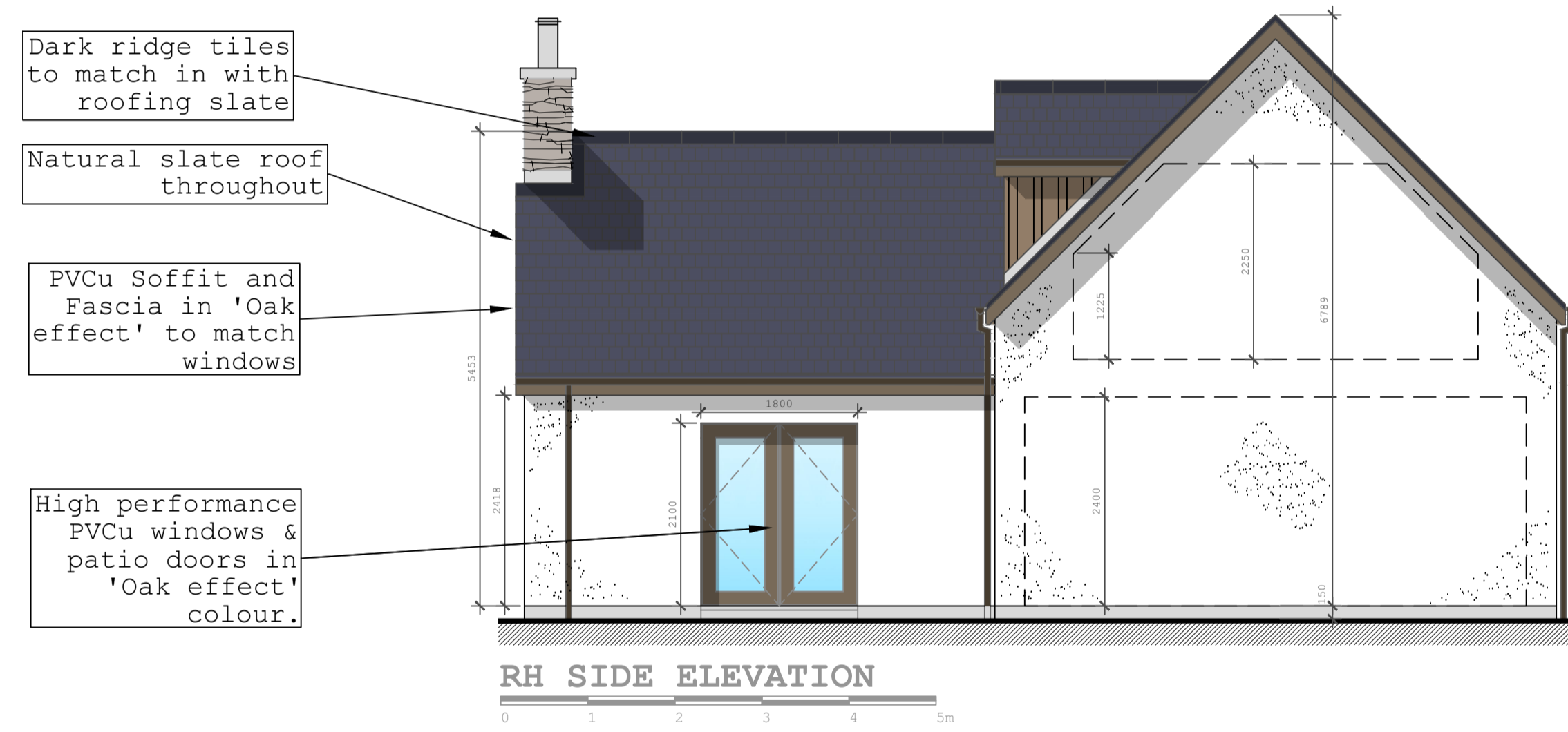
RH SIDE ELEVATION